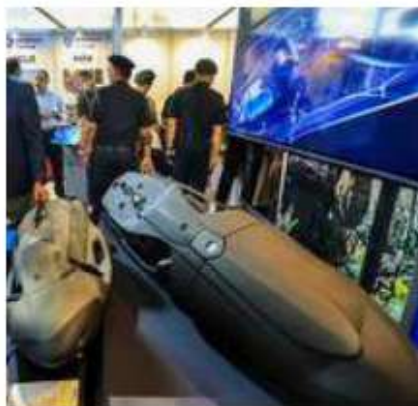
Military equipment on display at a seminar organised by the Society of Indian Defence Manufacturers in Jaipur.

Since the opening of the defence manufacturing sector to private players in 2016-17, the contribution of private companies has ranged between 19% and 20%. It stood at 19.39% in 2022-23 and 20.93% in