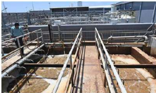
Fair play: The panel recommended the action plan for a more balanced and equitable economic development. SRINATH M.

The Standing Committee on Finance is chaired by Bharatiya Janata Party MP from Odisha Bhartruhari Mahtab. In its report, the Committee also pointed out that the Government's disinvestment plans had not progressed since they were announced and that the investment rate in India needed to be higher than it currently is.