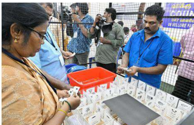
Rigorous check: VVPAT slips are counted in the case of mismatch between Form 17C and EVM data, the poll body said. FILE PHOTO

To clean-up and strengthen electoral systems, 476