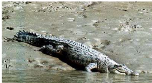
The State government has made major efforts to conserve saltwater crocodiles with a breeding facility opened in 1976. FILE PHOTO

"In comparison [to 2024], there is an increase in the number of all demographic classes [of saltwater crocodiles], specifically in the hatchling class. This is an encouraging sign as sighting of hatchlings is very rare and difficult in the terrain of Sundarbans," the Forest Department report, titled 'Population Assessment and Habitat Ecology Study of Saltwater Croco-