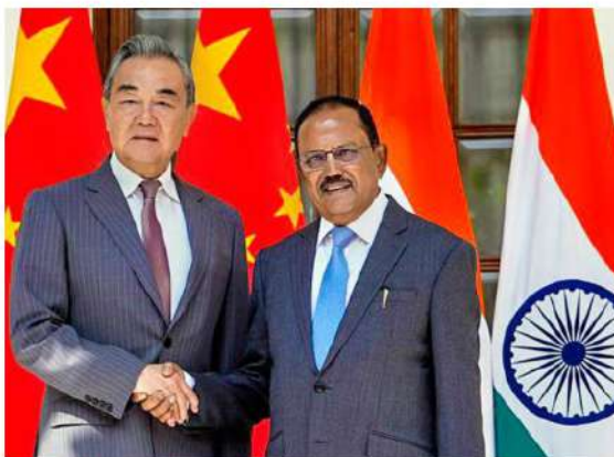
Renewed connections: NSA Ajit Doval with Chinese Foreign Minister Wang Yi during a meeting, in New Delhi.

Later in the evening, Mr. Wang called on Mr. Modi where the Prime Minister also recounted the importance of the meeting with President Xi and said, “India-China relations have