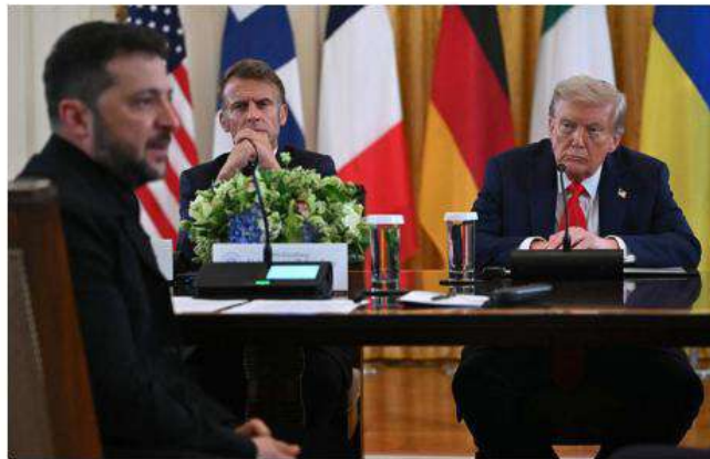
Keen eyes: French President Emmanuel Macron and U.S. President Donald Trump with Ukrainian President Volodymyr Zelenskyy.

He added that his “assurance” that no U.S. ground troops would deploy to Ukraine, and he categorically ruled out Ukraine joining the Western military alliance NATO.