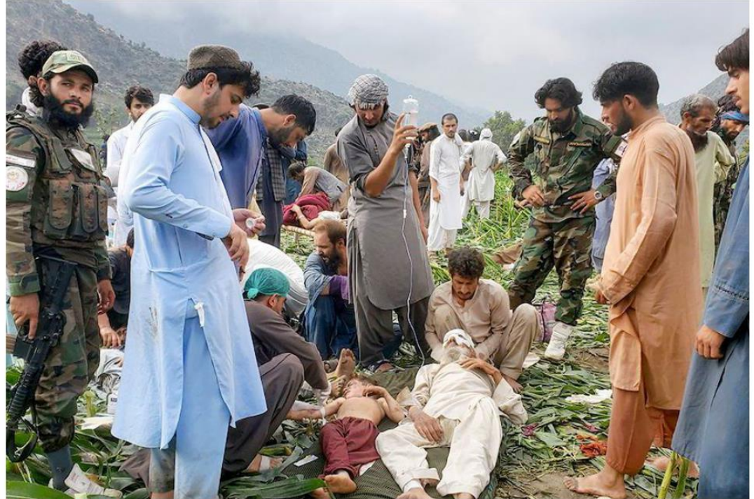
Devastating disaster: Civil defence workers, local people, and soldiers helping the injured in earthquake-hit Afghanistan.

In Wadir village in Kunar's Nurgal district, dozens of residents of the surrounding area helped