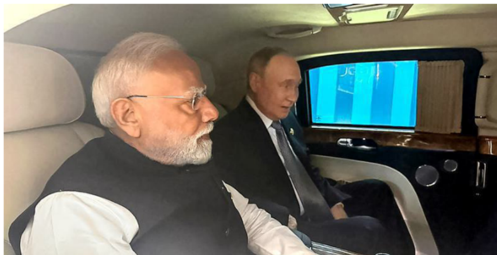
Prime Minister Narendra Modi and Russian President Vladimir Putin leave together in a car for the venue of their bilateral meeting after attending the Shanghai Cooperation Organisation Summit in Tianjin.

“Had an excellent meeting with President Putin... Discussed ways to deepen bilateral cooperation in all sectors,” Mr. Modi said in a social media post after the meeting, adding that the leaders “exchanged views on regional and global de-