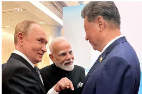
Power point: Prime Minister Narendra Modi with Chinese President Xi Jinping and Russian President Vladimir Putin in Tianjin on Monday.

'SCO plus' meeting on Monday afternoon, proposed a Global Governance Initiative (GGI), calling on countries to work in concert for a more just and equitable global governance system adhering to sovereign equality, abiding by international rule of law, practicing multilateralism, advocating the people-centered approach,