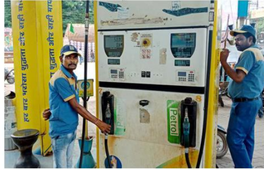
The petition says the policy violates fundamental rights of vehicle owners whose automobiles are incompatible with E20. FILE PHOTO

Senior advocate Shadan Farasat, appearing for petitioner Akshay Malhotra, cited NITI Aayog's 2021 report "Roadmap for ethanol blending in India 2020-25", which noted that blending ethanol up to 20% could cut fuel efficiency by 6-7% in four-wheelers