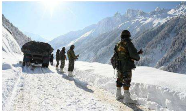
Ancillary support: Indian Army soldiers stand guard on a road near Zoji La connecting Srinagar to Ladakh, bordering China.

They are now operational only in Rajasthan and their utility was realised during the recent Operation Sindoor when their services were required to collect or disseminate information among the border population.