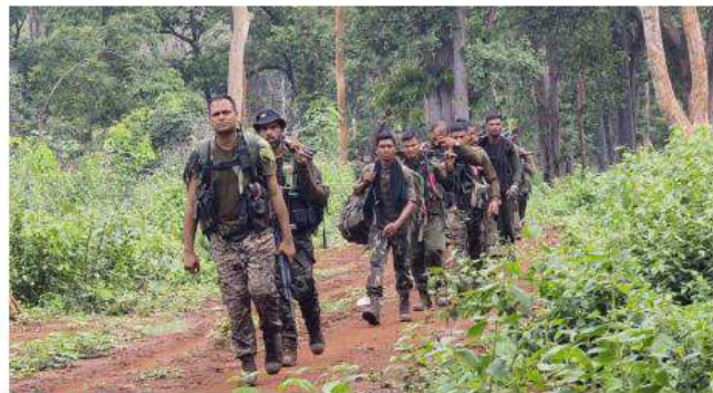
Lethal hit: Ten bodies were recovered and search operations were under way in Gariaband district of Chhattisgarh. FILE PHOTO

The police said that security personnel from the Special Task Force (STF, a unit of the State police),