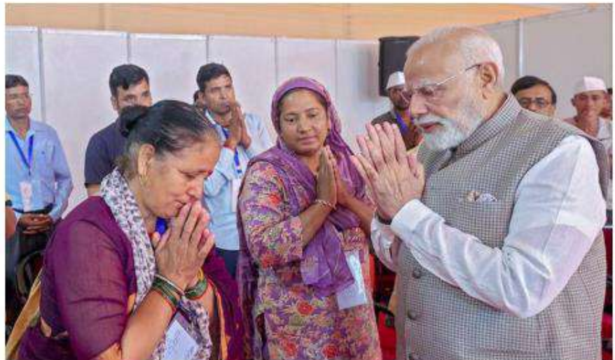
Prime Minister Narendra Modi interacting with residents of flood-affected areas of Uttarakhand on Thursday.

Mr. Modi met the families affected by the recent floods and expressed condolences to the kin of those who lost their lives. He appreciated the efforts of the personnel of the National Disaster Response Force, State Disaster Response