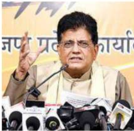
Union Minister Piyush Goyal in Patna on Thursday.

that the Union Cabinet on Wednesday approved two new projects for Bihar, including the Mokama-Munger four-lane highway costing ₹4,500 crore and a second railway track to be built on the Bhagalpur-Dumka-Rampurhat line.