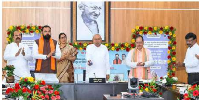
Clearing the scheme was the only agenda of the Cabinet meeting chaired by Bihar Chief Minister Nitish Kumar on Friday. FILE PHOTO

Clearing the scheme was the only agenda of the Cabinet meeting chaired by Chief Minister Nitish Kumar, who announced the Cabinet's decision through