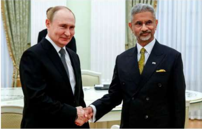
Strong ties: Russian President Vladimir Putin and External Affairs Minister S. Jaishankar had met earlier this month in Moscow.