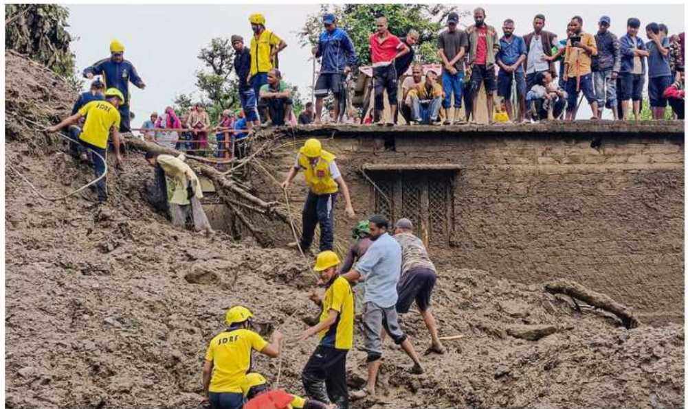
Under debris: State Disaster Response Force members during a rescue operation at a village in Rudraprayag, Uttarakhand on Friday.

The incessant rain and landslides in the Basukedar area of Rudraprayag caused heavy damage in more than half a dozen villages, said the SDMA. One woman died in a rain-related incident while eight