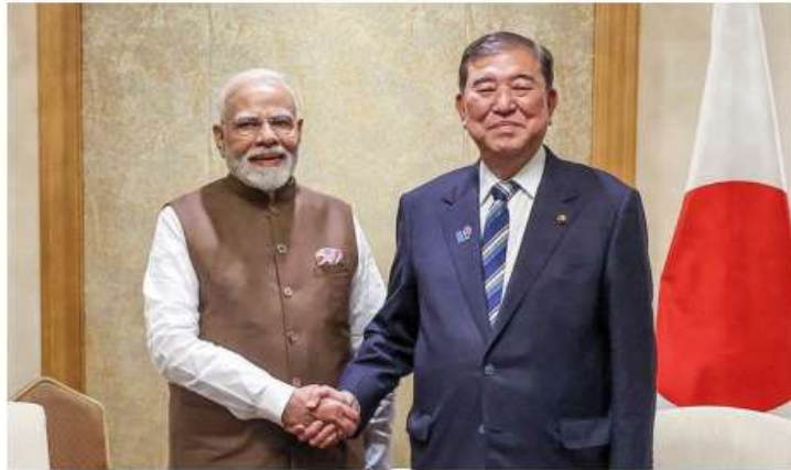
Narendra Modi with Japanese Prime Minister Shigeru Ishiba during the India-Japan Economic Forum in Tokyo on Friday.

On July 31, Mr. Trump had criticised India for its